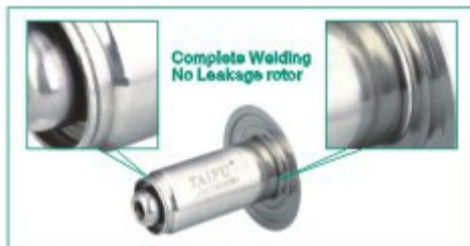
THIS DESIGN IS SUITABLE FOR ALL OF THE CIRCULATING PUMP MODELS